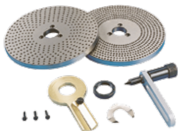
DP-2, DP-3, DP-4, DP-5