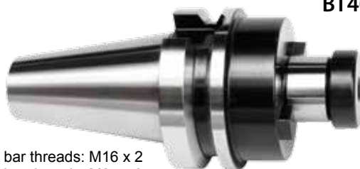
BT40 & BT50