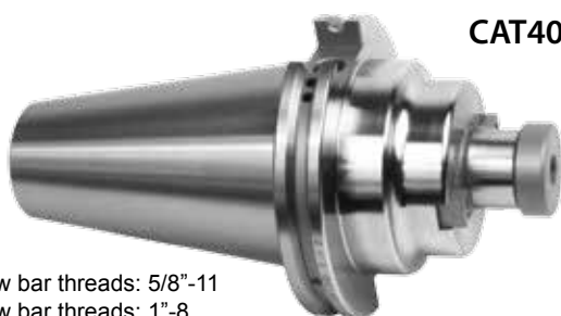
CAT40 & CAT50