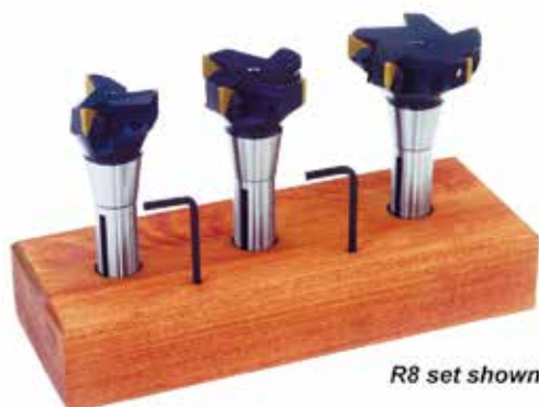
R8 set shown These end mills take TPU inserts