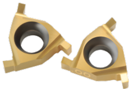
CARBIDE GRADE BXC: P30-P50 K25-K40