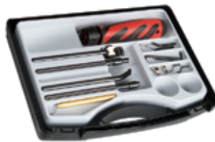
Classic Handle A