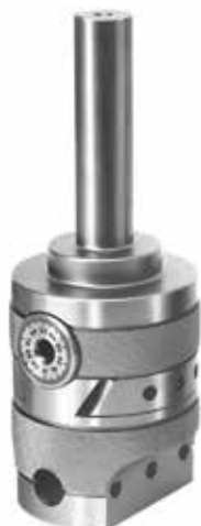
3/4" Straight Shank